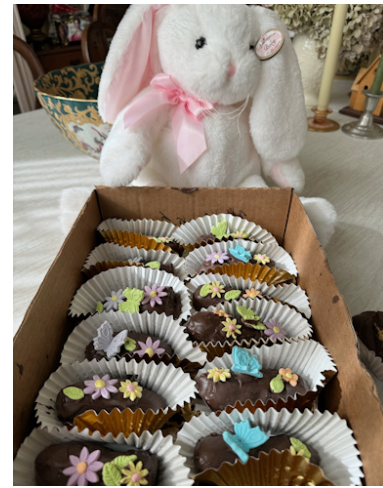
Delicious and beautiful Easter eggs.