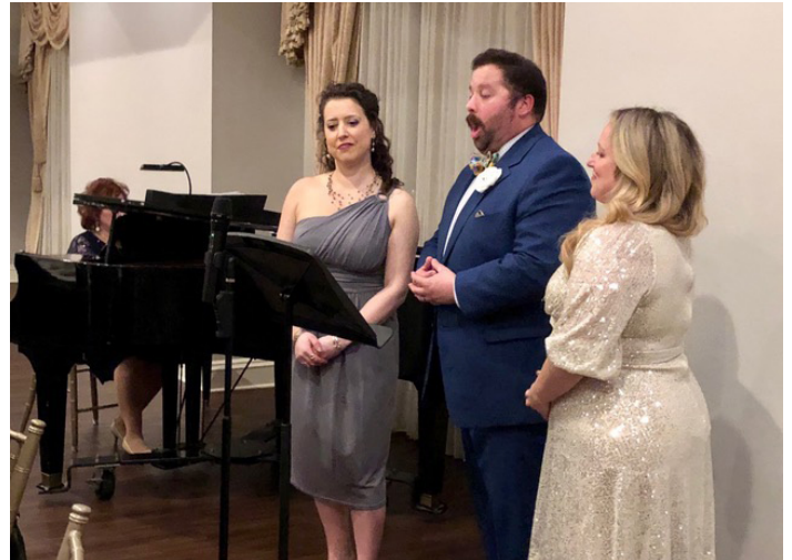
A final song from all three singers from Boheme Opera NJ.