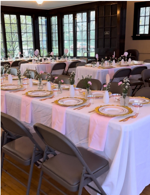
Renters bring their own individual vision when they rent our beautiful club to celebrate their events.

department answers rental requests from our website, tours prospective renters through the clubhouse, manages paperwork required for rentals, and welcomes the renter at the club the day of her event. We also inspect after rentals to ensure the club has been restored to order after the renter's occupancy. Rental income provides operating and maintenance funds for our building.