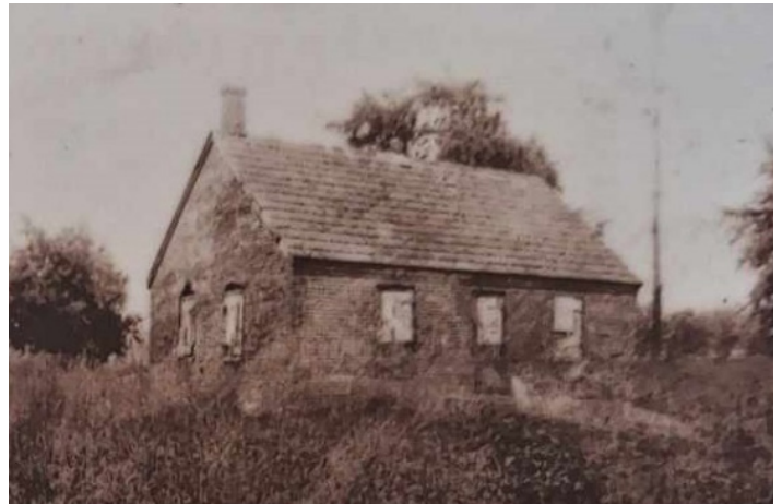
Riverton's first school was a brick, one-room schoolhouse, built in 1822, at the corner of Elm and Broad Streets, referred to as the "riverfront school".