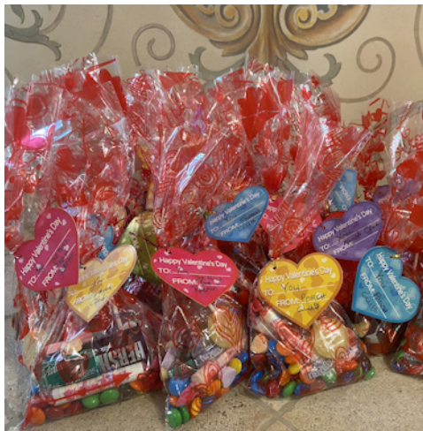
Goody bags filled with candies and mini stuffed animals for the residents at Riverview Estates.

February 14 - Arts and Culture wanted to do a good deed for Valentines Day so we donated goody bags filled with candy and mini stuffed animals to the residents of Riverview Estates Nursing Home. We were hoping to brighten their day.